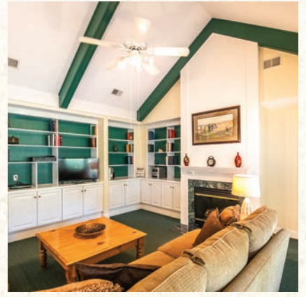
Get together in the spacious great room for a movie or game night.