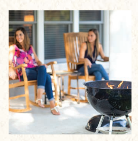
Relax under the covered terrace during an evening shower or a barbeque gathering.