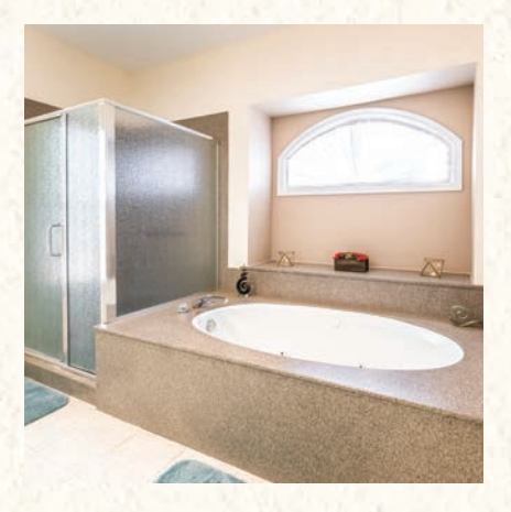
You will find luxury and comfort in the master suite bathrooms.