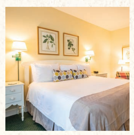
Enjoy the comforts of home while staying in the master suite with a king size bed.