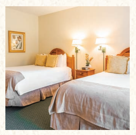
The master suite with two queen size beds allows guests to rest in comfort with plenty of space.