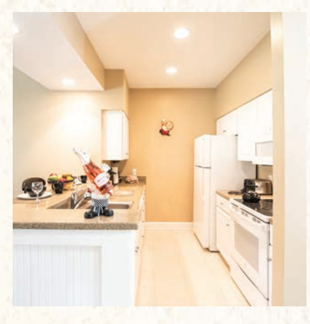
Each home comes with a fully-equipped kitchen, with everything you need to make a delicious meal for your guests.