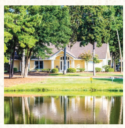
Welcome to your house at The Owners Club, where you will feel right at home.