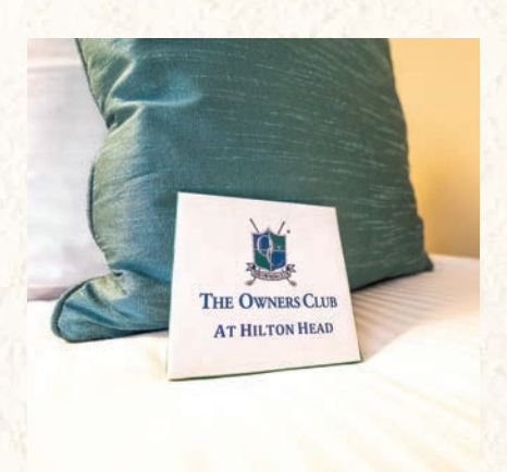
The staff at The Owners Club at Hilton Head Island is there to make your stay comfortable.